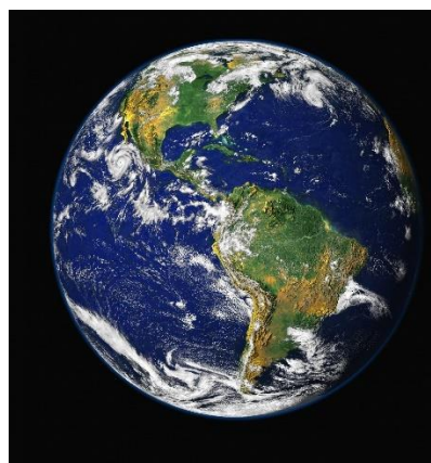
The Earth. God's creation.