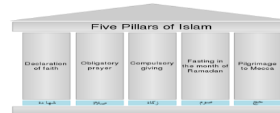
The Five Pillars of Islam