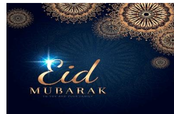
Eid – ul – Fitr